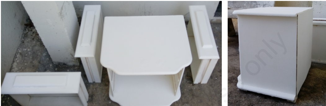
Figure A5. Bedside table after application of the third coat.