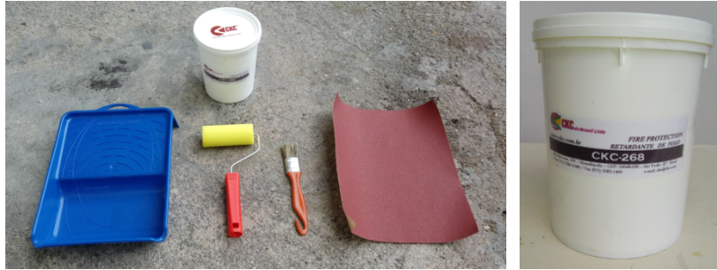
Figure A1. Material used to paint the bedside table.