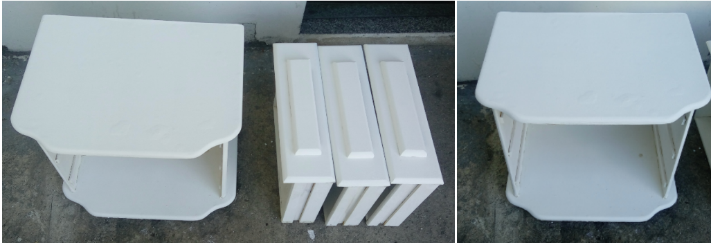
Figure A4. Bedside table after application of the second coat.