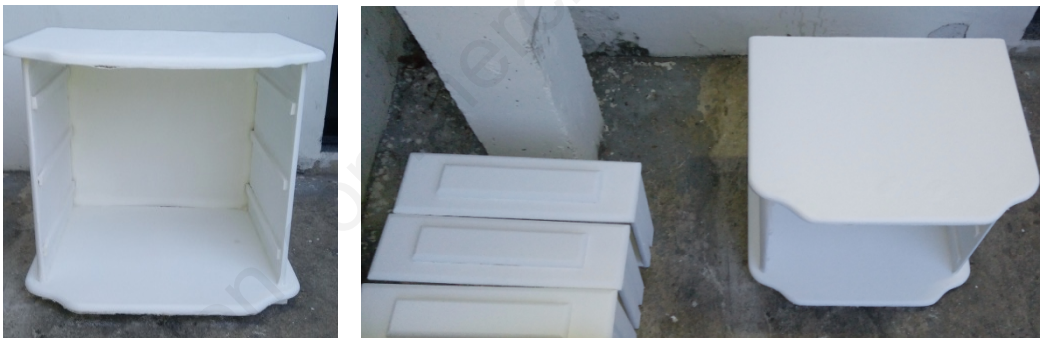
Figure A6. Bedside table after application of the fourth coat.