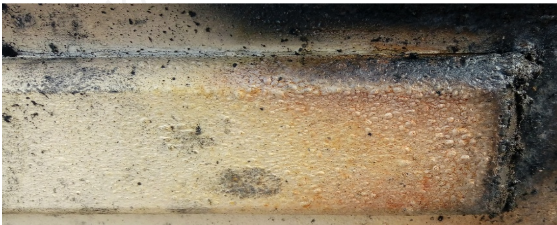
Figure A9. Drawer handle of bedside table highlighting the expansion of intumescent paint after heating.