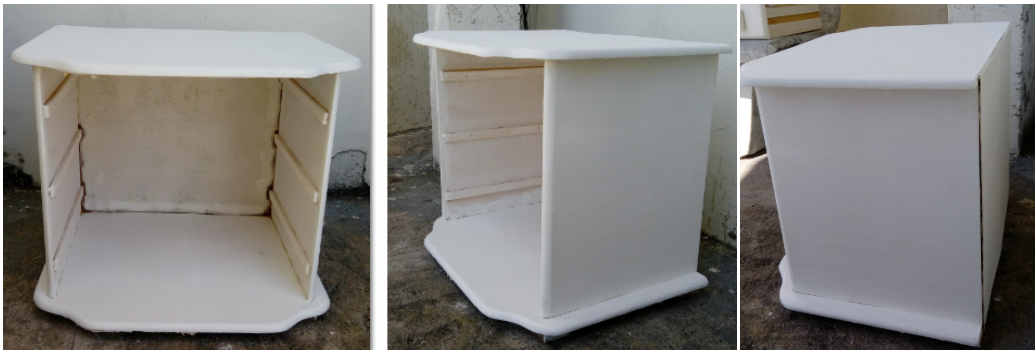
Figure A3. Bedside table after application of the first coat.