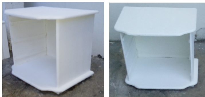
Figure A7. Bedside table after application of the fifth and final coat.