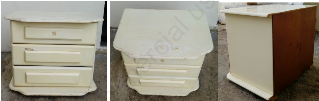
Figure A2. Bedside table before the application of the intumescent product.